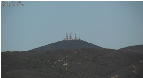
720p 18x Full Zoom