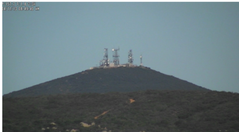
720p 30x Full Zoom